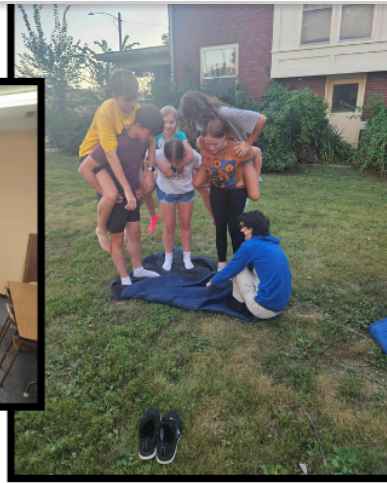
PYF HAVING SOME FUN AT FALL KICK-OFF AND PYF SUNDAYS