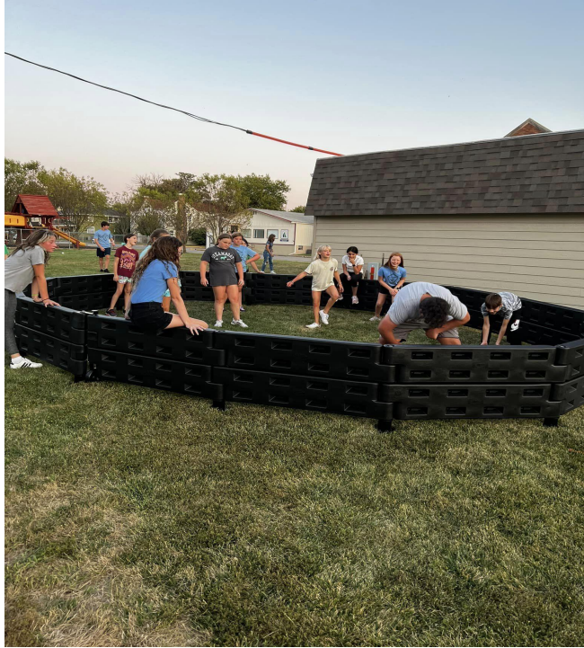
PYF and First Methodist Church Youth Group joined up for some Ga Ga Ball Fun last Sunday! A great start to a new school year or PYF fun!!