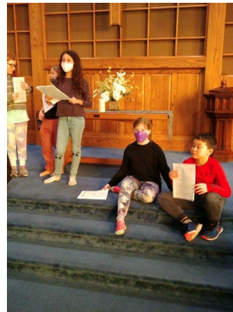
Practicing hard for the Musical!