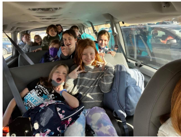
Wednesday Operation Joy Adventures!