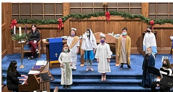
White Gift Service