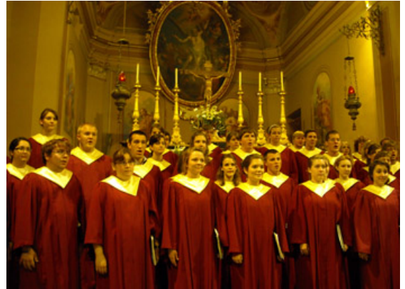
Above: The A Capella Choir from their 2009 tour of major basilicas and cathedrals throughout Italy..